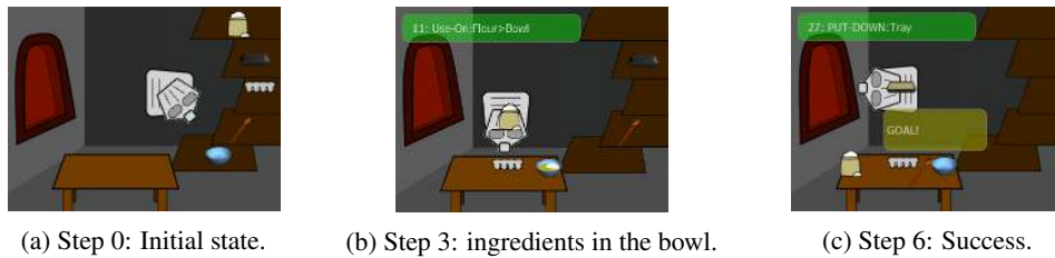
Figure 1: Sophie’s kitchen, the environment used in the study in three different states.

Study setup The study involves 40 participants (age M=25.6 , SD=10.09 ; 24F/16M) divided into two groups. The first group interacts with IRL and the second one with SPARC. Participants first teach the robot how to complete the task and then a testing phase, where participants’ inputs are disabled, evaluates the robot behaving on its own to assess participants performance in teaching. To limit the study time, a hard limit of 25 minutes for the teaching phase has been set for both systems, but participants could move on to the testing whenever they desired.