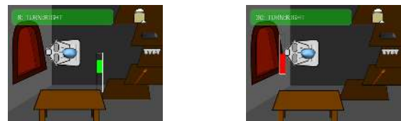
Figure 1: Examples of positive (left) and negative (right) reward in the robot cake baking task.

Interactive Machine Learning (IML) is a field of research which aims to include end-users in the machine learning process [1, 3]. The idea is to move away from robots as