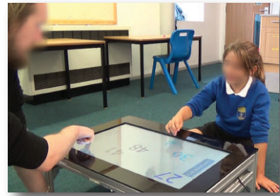
Fig. 1. Images of the interactions: (left) the robot condition, (right) the human condition. Interactions take place around a touchscreen which displays the learning material. Both the child and the tutor (whether human or robot) can move numbers on the screen. Feedback is provided by the tutor, and not on screen.