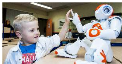
Figure 1: The Aldebaran Nao was selected as the common robot platform, to facilitate consistency and reproducibility.

to the therapist when appropriate would improve both the interaction and the therapeutic outcome.