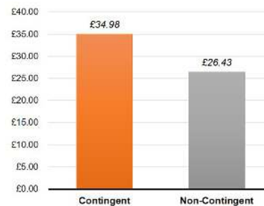
Fig. 2. Comparison of money collected in the two conditions, demonstrating a 32.2% increase for the socially contingent condition over the control.

Subjectively however, a number of members of the public who engaged with the robot reported that the robot looked “creepy” or “scary”, particularly in the contingent condition, where the robot attempted to make eye contact. This suggests that the mere addition of a human-like competence is not desirable [9], and that further refinement of behaviour is necessary to make it appropriate (e.g. the addition of suitable gaze-aversion strategies).